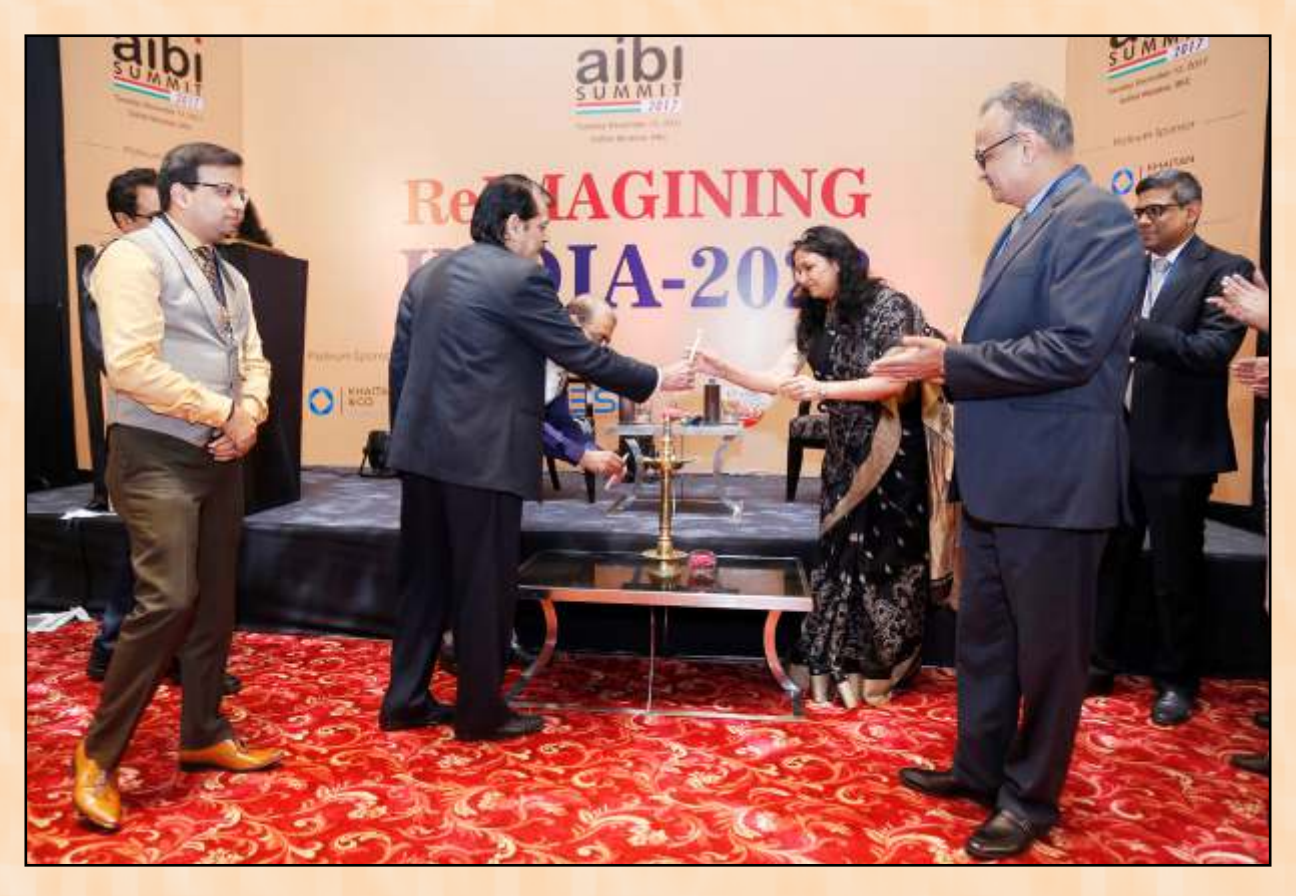
AIBI Summit 2017 – Inauguration - Board of Directors ,AIBI