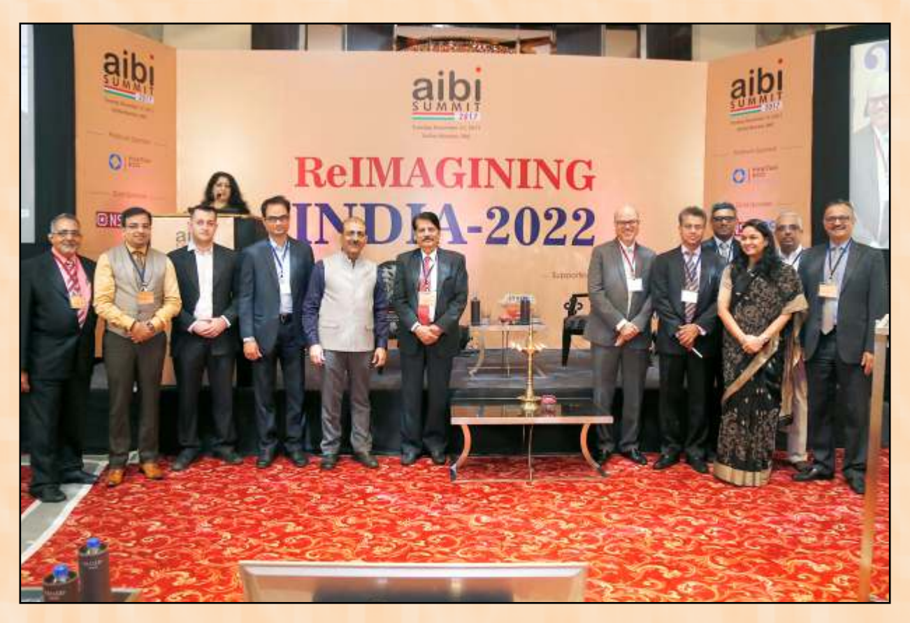
AIBI Summit 2017 – AIBI Directors